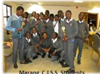
Marang C.J.S.S Students