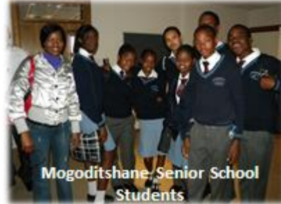
Mogoditshane Senior School Students